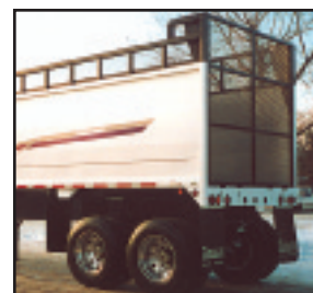
L.B. air trip