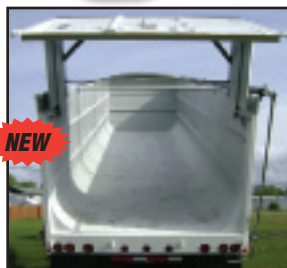
Obstruction free hydraulic lift