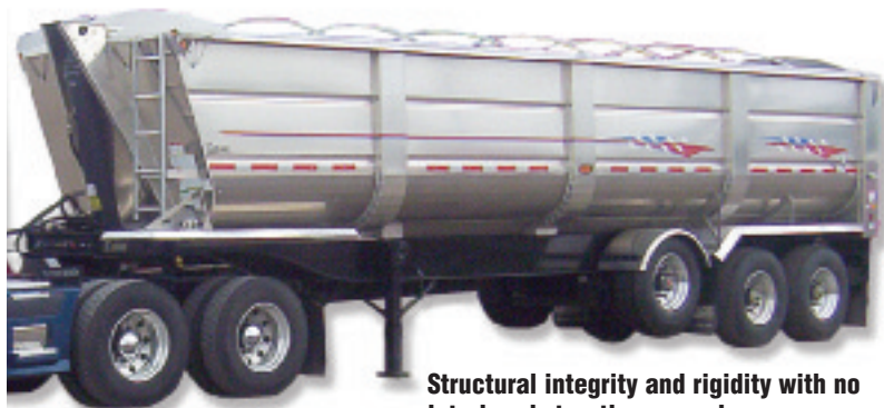
Structural integrity and rigidity with no interior obstructions anywhere