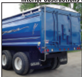
3 pc. swing-out