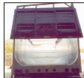
obstruction free interior